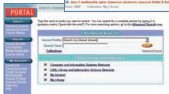
ZPORTAL PROVIDES A SINGLE SEARCH ACROSS YOUR CHOICE OF MIXED RESOURCES